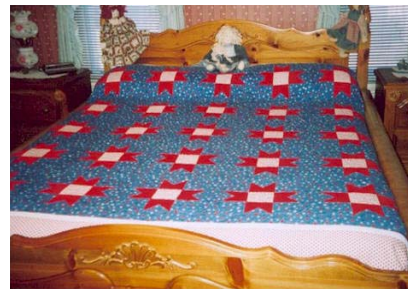
Queen Sized quilt handmade

The quilt raffle is on-going and will wrap up on December 3rd at the Christmas Auction. We have sold many tickets but we would like to at least double what we have already sold. First place is this