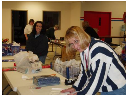
Christmas "rappers" at Alek Inc.