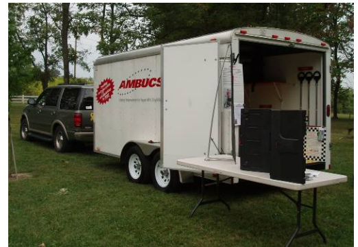
MOBILE DEMO SITE AT BEAVERCREEK CHAMBER CHAT SPONSORED BY CEMEX (SPLIT THE POT WAS DONATED TO GREENEBUCS).