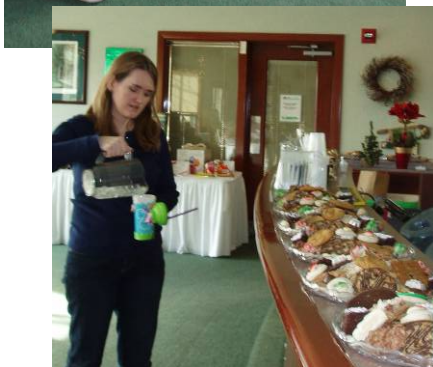
Cookies, Cookies, Cookies