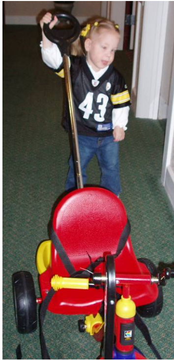
She has a new Toddler!