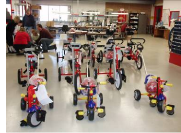
Kids having a MERRY CHRISTMAS THANKS to everyone who helped out with the Christmas Auction