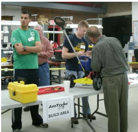
VOLUNTEER GROUP FROM WPAFB SUPPORTED THE MODERN WOODSMAN BENEFICIAL GROUP COMMUNITY DAY BY BUILDING AND REPAIRING AMPTRYKES