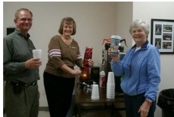
GreeneBucs members getting their “caffeine fix” before they start in on the training sessions