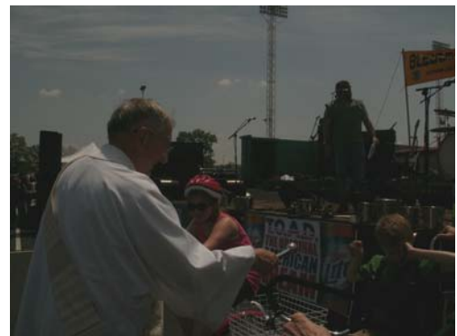
One of the priests blessing the new Trykes