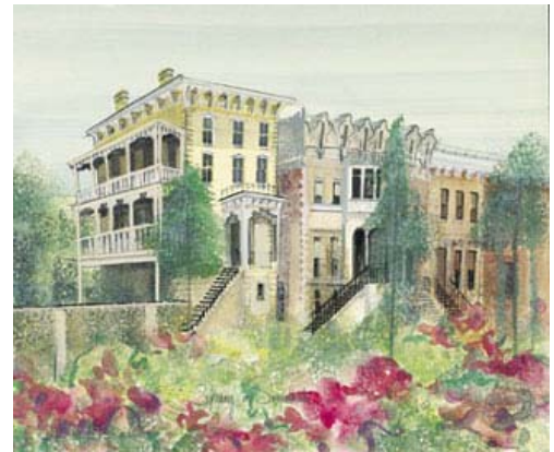
P. Buckley Moss print