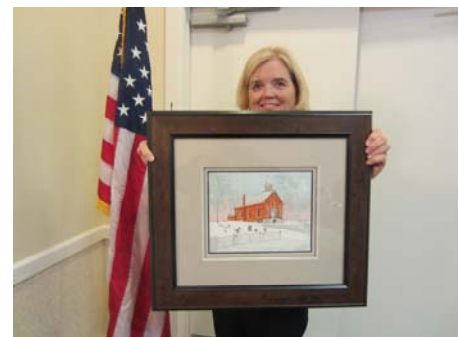
Picture for raffle

A tryke will be given away at this event.