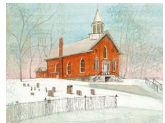
“Winter at St. Thomas”